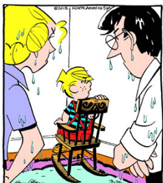
"YOU GUYS BOUGHT THE 'SUPER SOAKER' FOR ME. DID YOU SERIOUSLY THINK I WOULDN'T USE IT?"