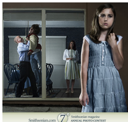
Smithsonian.com 7 Smithsonian magazine ANNUAL PHOTO CENTER