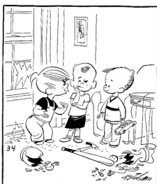
*TAT TAKES CARE OF THE MURDER AND MURDER. ASK: HOW TO USE THE LAMP?*